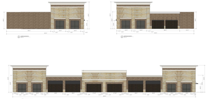
Building 3 | Elevation