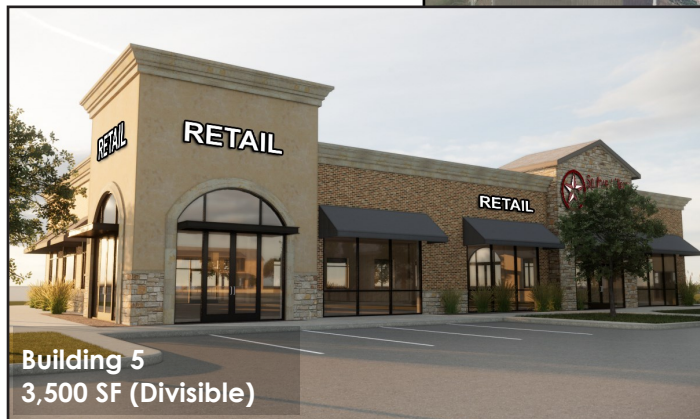
Building 5 3,500 SF (Divisible)